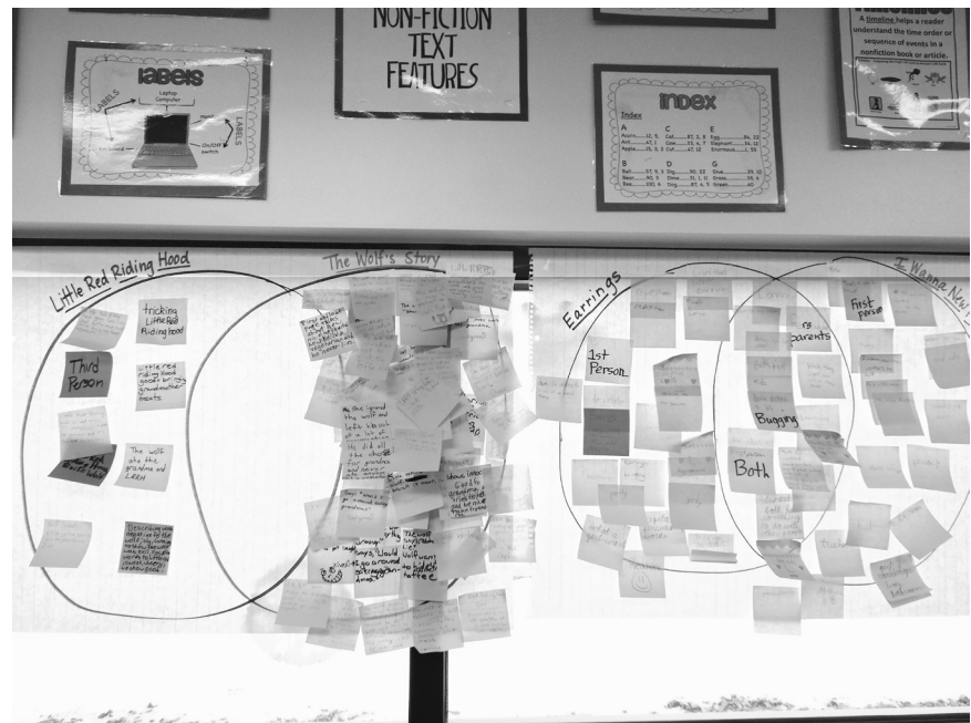
Venn diagrams representing both the reading and writing. One is for the two fairy tales. The second compares and contrasts two books on POV.